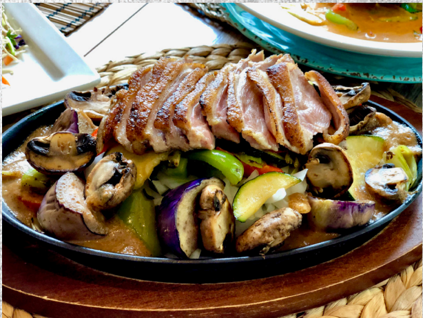
Duck with Black Pepper Sauce 17.95 Pan-seared duck breast served with pan-grilled mixed vegetables, mushroom, and black pepper sauce.