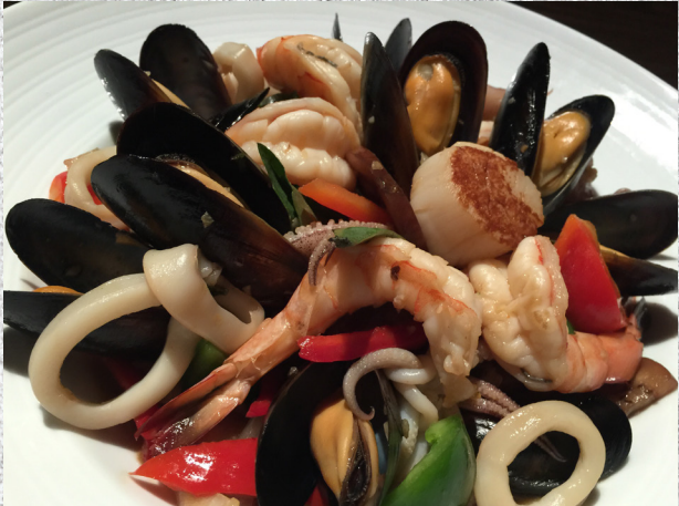
Hot Basil Seafood 18.95 Sauteed seafood combination in chili-garlic sauce, basil, baby corn, bell pepper, eggplant, and onion