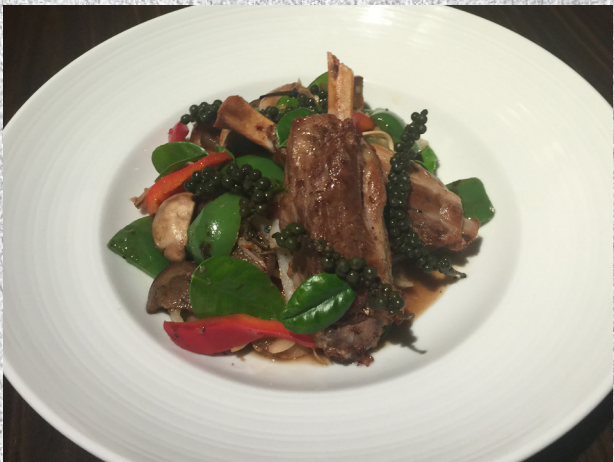
Pork Shank Pad Cha 16.95 Braised pork shanks, bell pepper, eggplant, green beans, wild ginger, mushroom, and fresh peppercorn