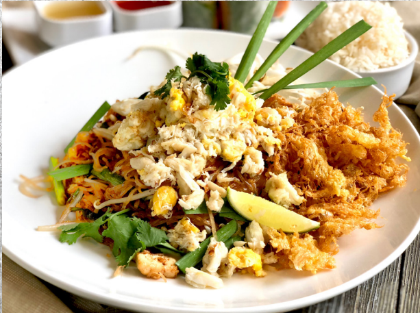
Crab Meat Pad Thai 17.95 Thai famous Pad Thai noodles with real crab meat and crisp-fried egg