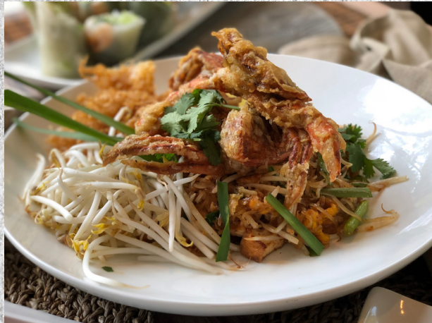
Soft Shell Crab Pad Thai (1) 16.95 (2) 23.95 Pad Thai noodles with soft shell crab tempura and crisp-fried egg