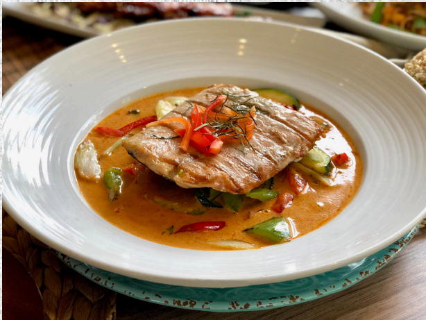
Panang Salmon 15.95 Pan-seared salmon served with pan-grilled mixed vegetables