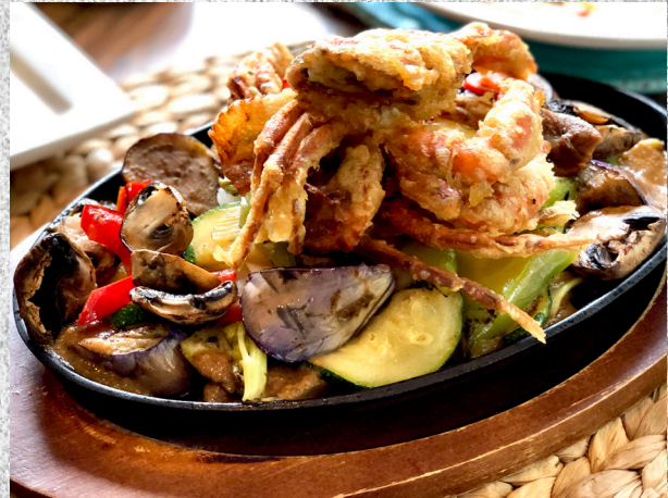
Soft Shell Crab Black Pepper (1) 16.95 (2) 23.95 Soft shell crab tempura served with pan-grilled mixed vegetables, mushroom, and black pepper sauce.