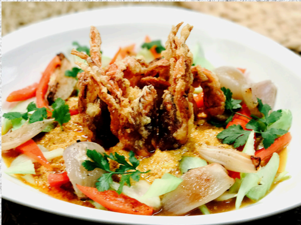
Soft Shell Crab Pong Karee (1) 16.95 (2) 23.95 Soft shell crab tempura in curry-roasted chili sauce, egg, bell pepper, celery, and onion