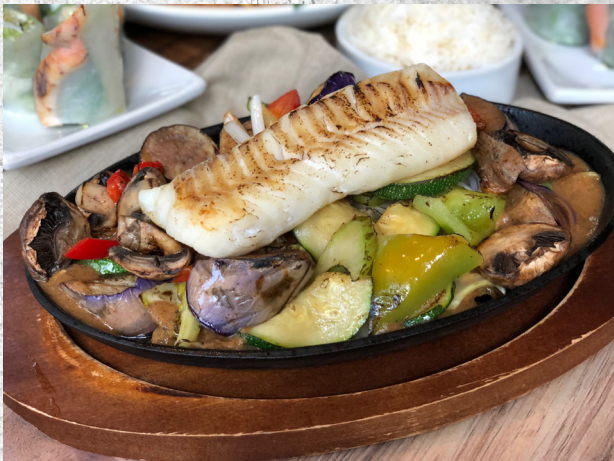
Garlic-Black Pepper Fish 16.95 Pan-seared white fish fillet with special black pepper sauce, bell pepper, mushroom, celery, and zucchini