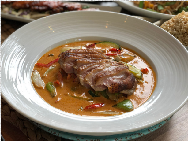
Roasted Duck Curry 17.95 Roasted duck in Panang curry with pineapple, eggplant, bell pepper, celery, and zucchini