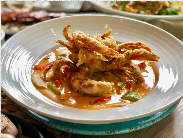
Panang Soft Shell Crab (1) 16.95 (2) 23.95 Soft shell crab tempura served with pan-grilled mixed vegetables