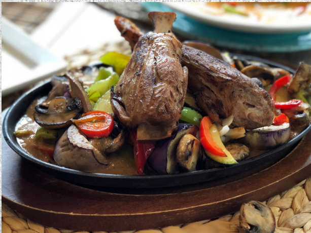
Garlic-Black Pepper Pork Shank 16.95 Braised pork shank served with pan-grilled mixed vegetables, mushroom, and black pepper sauce.