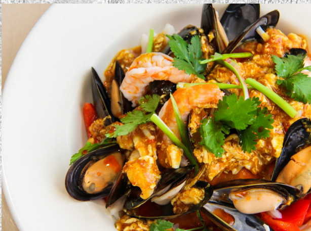
Seafood Pong Karee 18.95 Pan-fried seafood combination in curry-roasted chili sauce, egg, bell pepper, celery, and onion