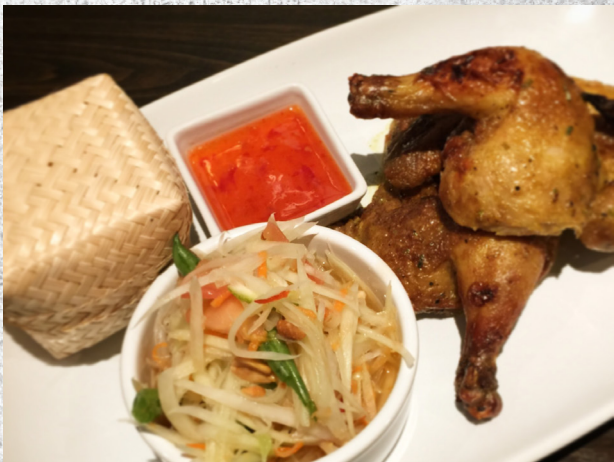
Thai BBQ Chicken 16.95 Traditional Thai style roasted chicken served with sweet-chili sauce, papaya salad, and sticky rice