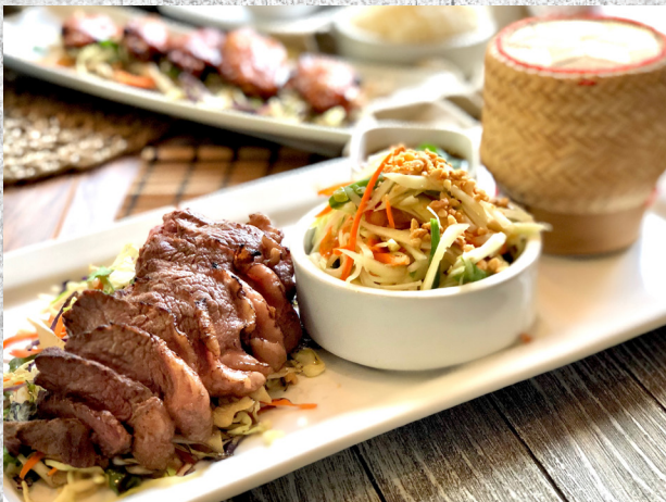
Suer-Rong-Hai (Crying Tiger) 16.95 Grilled marinated Top Sirloin fillet served with spicy tamarind sauce, papaya salad, and sticky rice